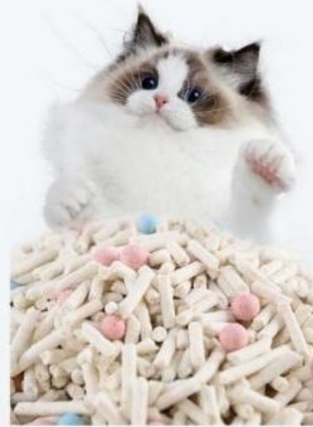
Pet feeds, Cat litter